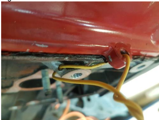
Fig.1 B series